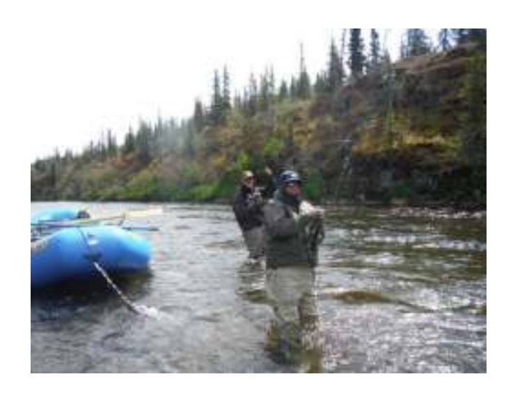
Double Sockeye Salmon Hook-up