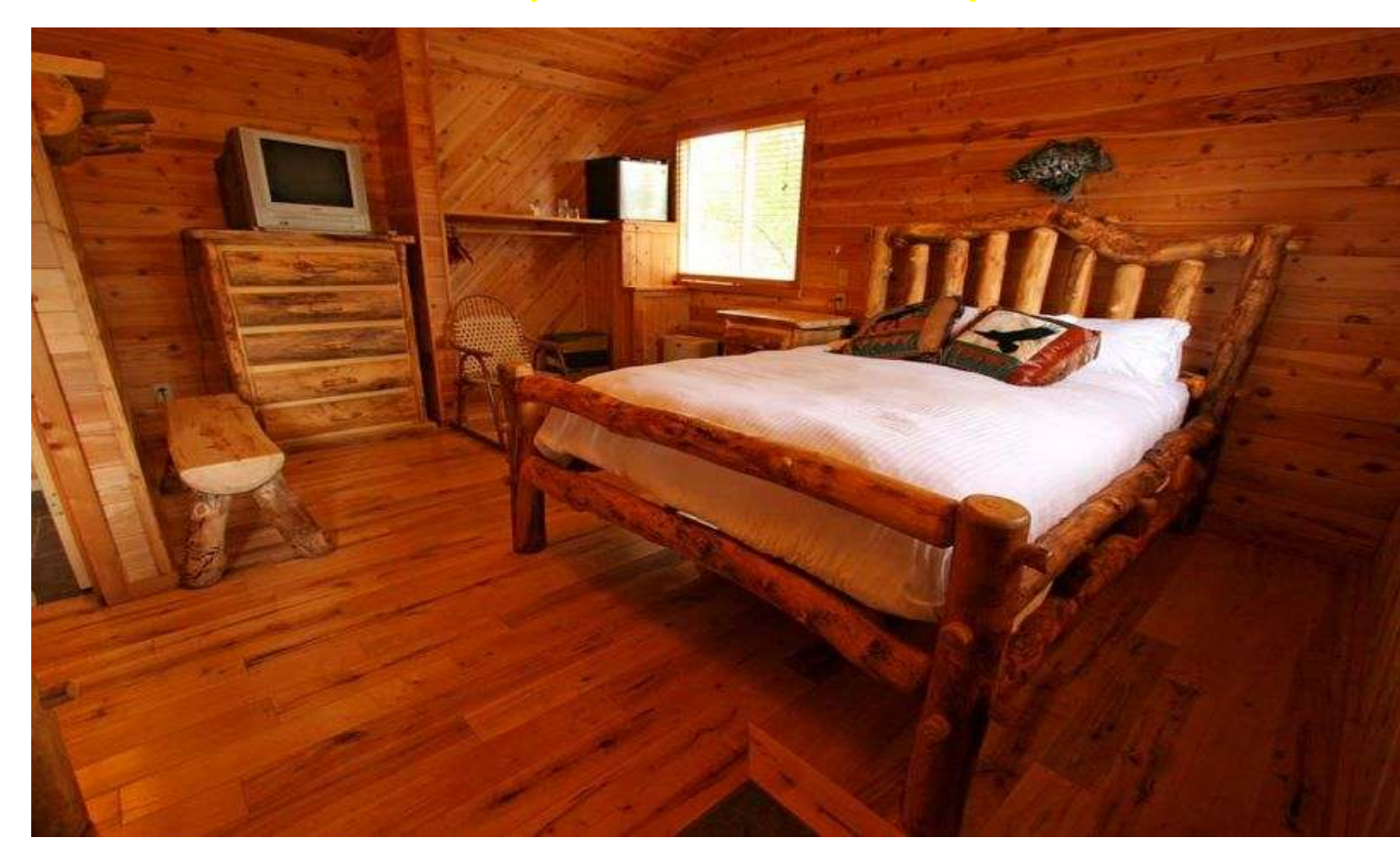
CABIN BEDROOM (second bed and bathroom are out of the photo to the left)

The cabins at the lodge feature beautiful natural cedar. Each cabin has an Indian slate entry, maple hardwood floors, bathroom, glass shower, hand-made Aspen log furniture, custom built wall sconces & chandelier, pillow-top mattresses and a TV with DVD capabilities. Some cabins have queen beds.