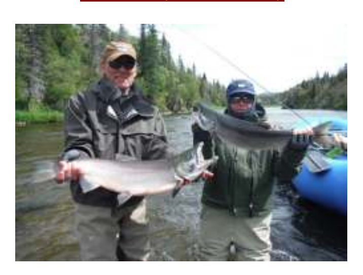
Sockeye Salmon Landed