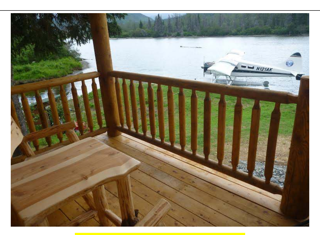
Deck of Cabin #1 and Beaver Float Plane